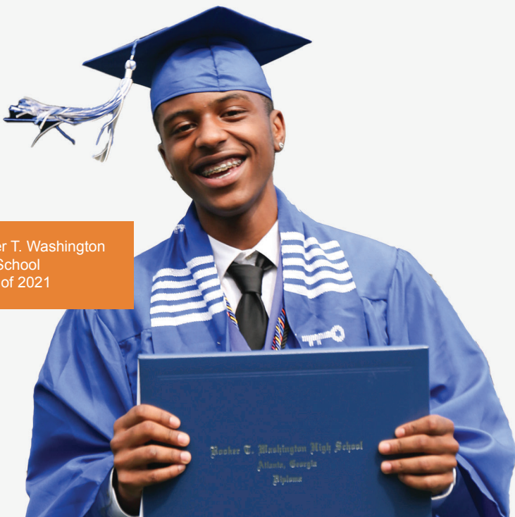
Booker T. Washington High School Class of 2021