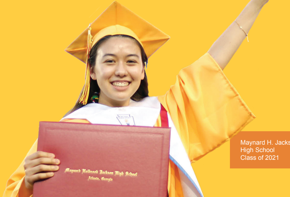
Maynard H. Jackson High School Class of 2021

Georgia Institute of Technology | McCamish Pavilion www.atlantapublicschools.us/gradnation